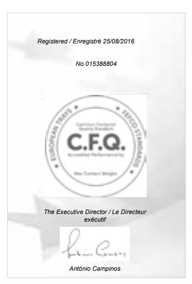
EU trademark certificate of the EUIPO (European Union Intellectual Property Office)

FEFCO is proud to announce that the C.F.Q. (Common Footprint Quality) EU trademark has been officially registered!